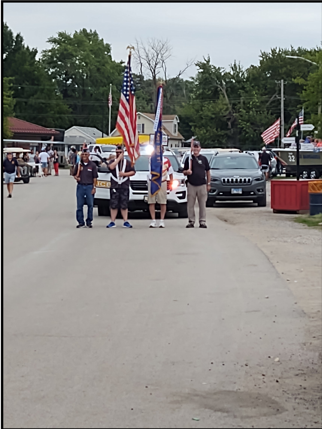
Opening Parade-Veteran's Day