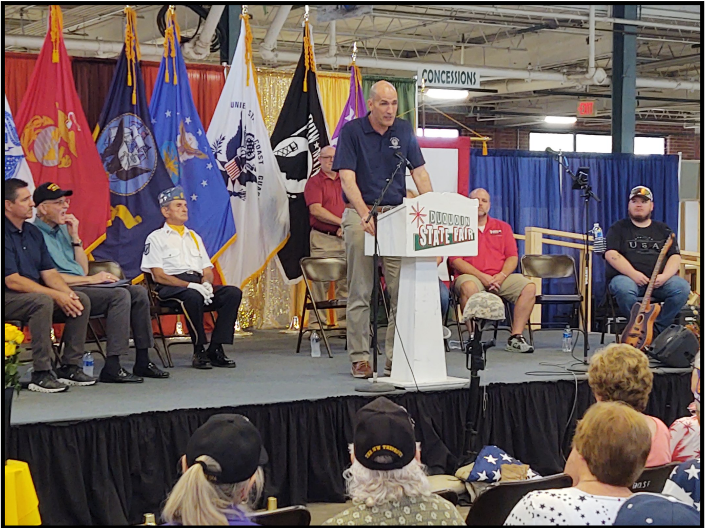
Illinois Department of Veterans Affairs Director