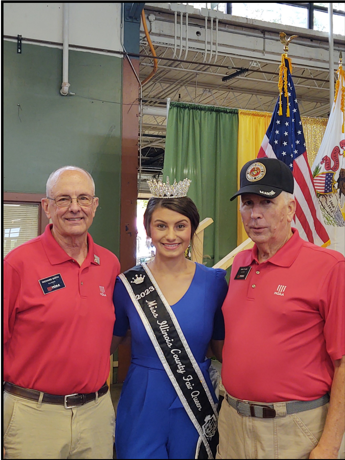
Another group shot with the Fair Queen